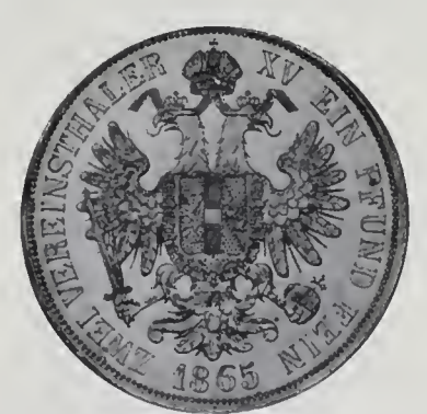
Lot No. 2618